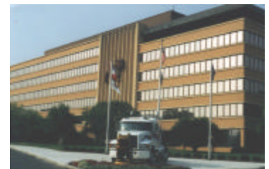
Mack Trucks Corporate Headquarters Allentown, Pennsylvania

As a result of this success, the ED 2000 system was installed on both the 1000-ton cooling system in this building and the evaporative condensers located at the research laboratory.