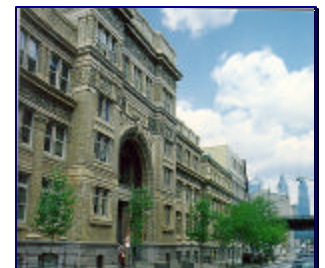
Main Administration Building Drexel University Philadelphia, Pennsylvania

The results demonstrated the chillers operating efficiencies