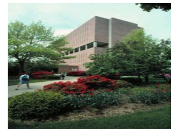
Ganser Library, Millersville University Millersville, Pennsylvania

In 1996 he installed the ED 2000 without any additional scale inhibiting chemical treatment program. Today the 175 ton cooling system is operating at design.