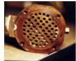
Heat Exchanger After ED 2000