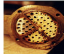
Heat Exchanger Before ED 2000

sciences using the basic principles of electronic descaling technology. This research is the foundation for a better understanding of this technology and how it can be successfully applied to solving mineral precipitation fouling that has plagued industry.