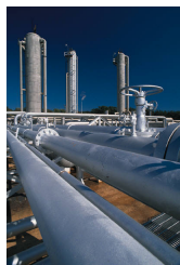
The ED 2000 was installed in a Gas Processing Facility in Texas