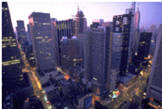
ED 2000 Anti-Fouling Systems are available worldwide.